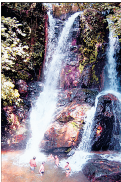
Tourists cool off in the refreshing waters at Panama's Las Yayas waterfalls, one of many holiday side trips.

But tourism is not the major reason Panama has the fastest growing