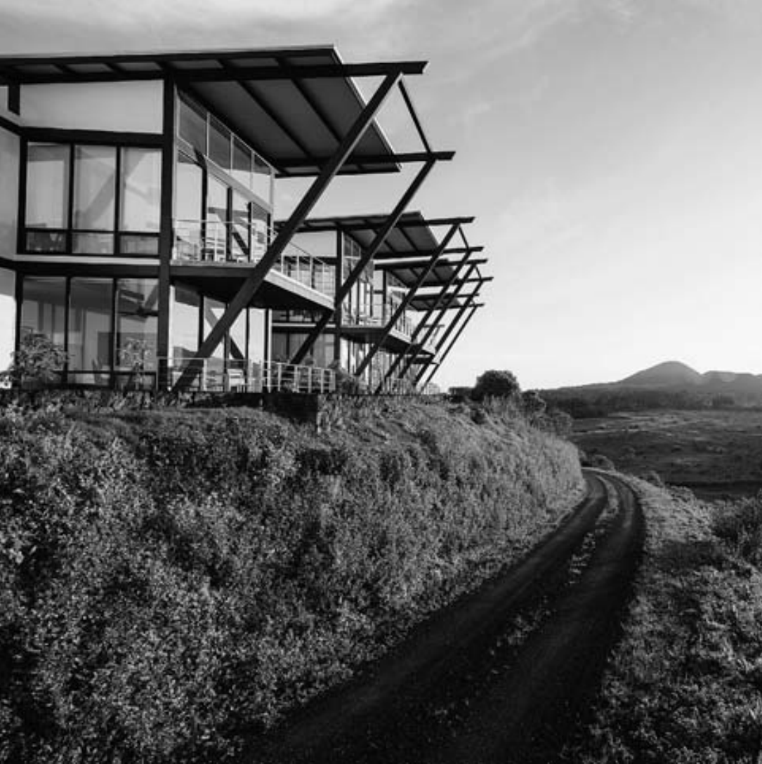
The Pikaia Lodge has 14 suites and is constructed of recycled steel, glass and natural stone.