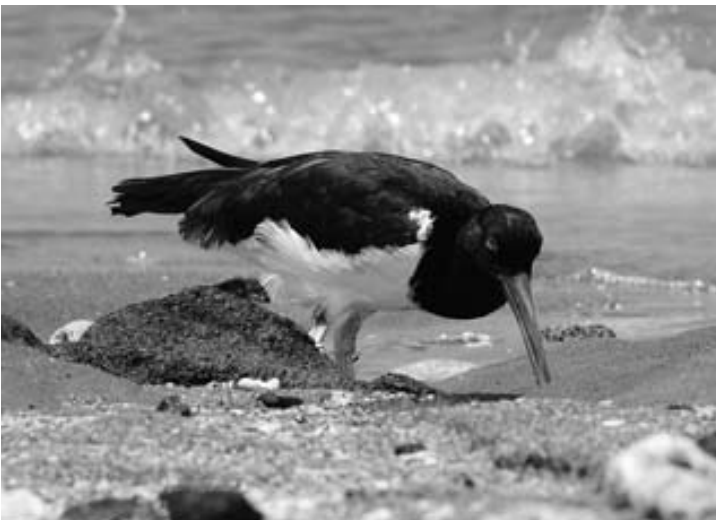
Tourists can see a vast variety of animal species on the islands, ranging from seabirds to giant tortoises and crabs. In all, there are 30,000 species on the island.