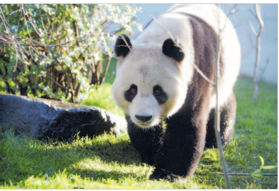
Yang Guang prowls his habitat at the Edinburgh Zoo. He and a female, Tian Tian, are on loan from China.

Whether you're a modern or traditional sort, a visit to the Edinburgh Zoo \, will have you rooting for the arranged marriage of Yang Guang and Tian Tian, two giant pandas on loan from China. Send the big galoots your warmest wishes that romance will blossom and an heir to the declining species will be born on Scottish soil.