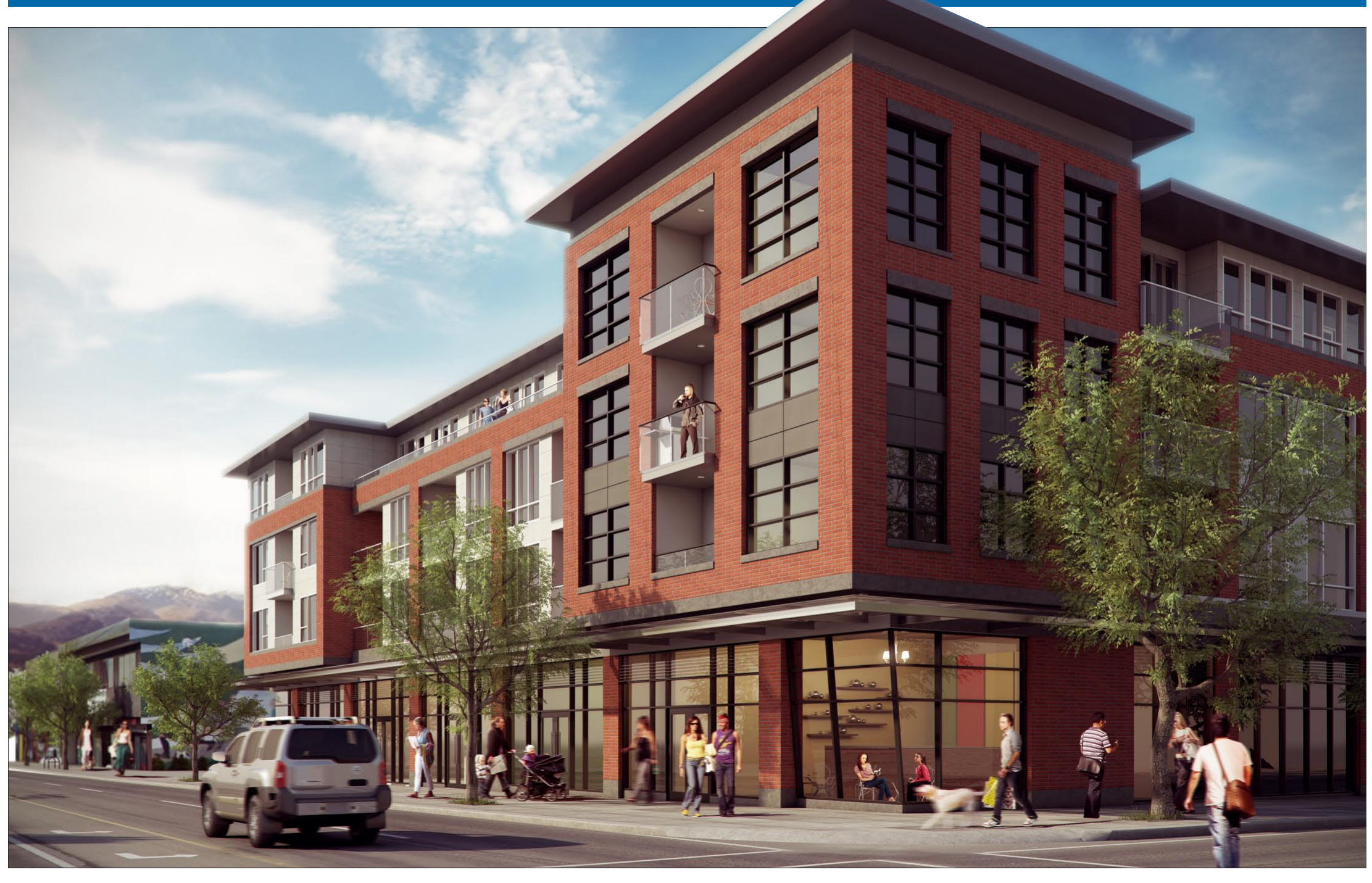
Bluetree's blend of modern design and vintage style at Main Street and King Edward Avenue is the perfect fit for this sought-after neighbourhood. Only 39 homes are available.